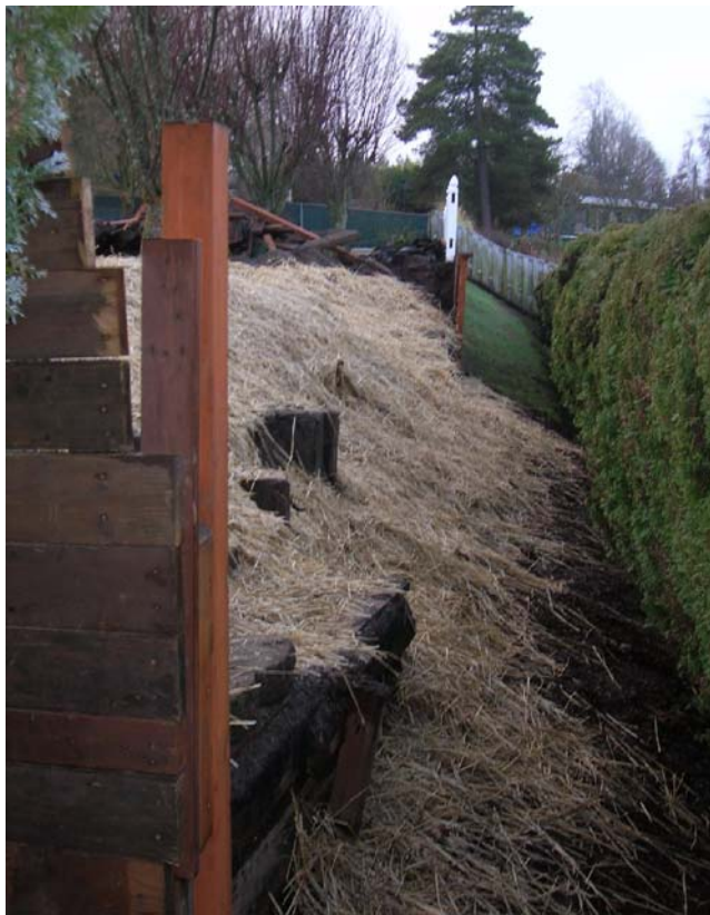
The missing fence and retaining wall after the deluge.

For those of you who have rebuilt your own railroads in the past, or are currently building your first