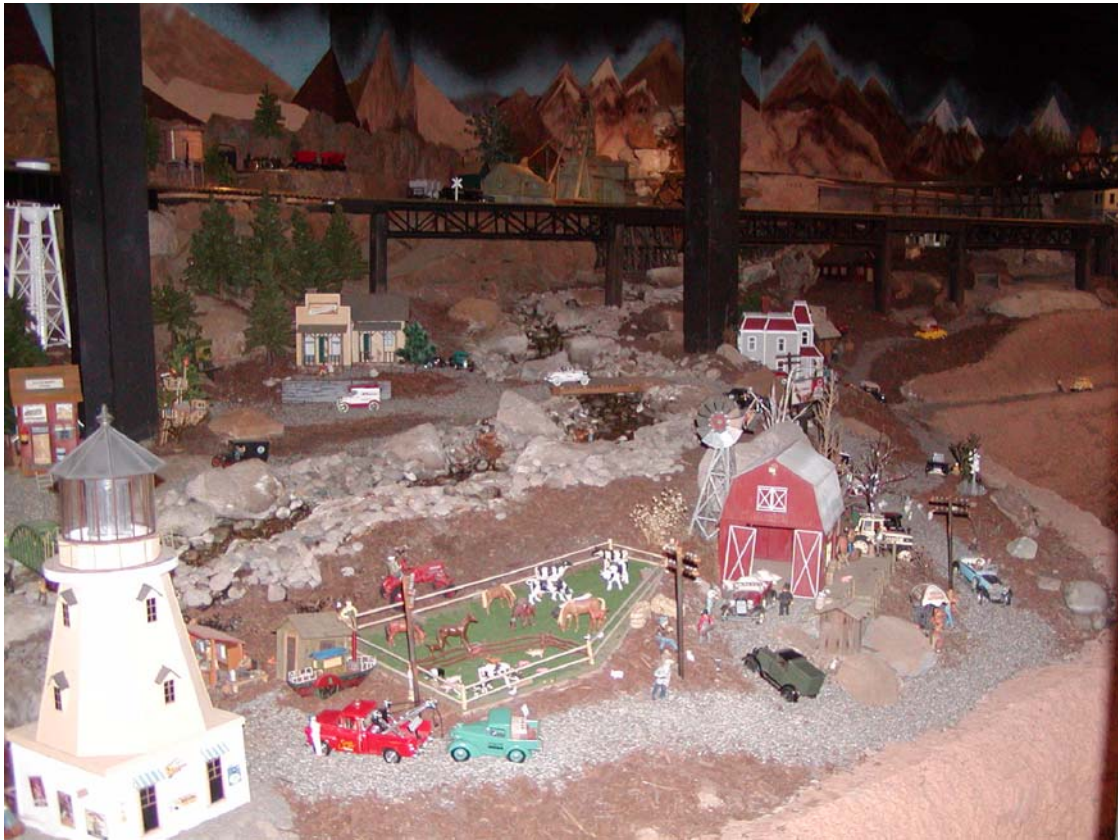
A scene on the Underground Railroad.