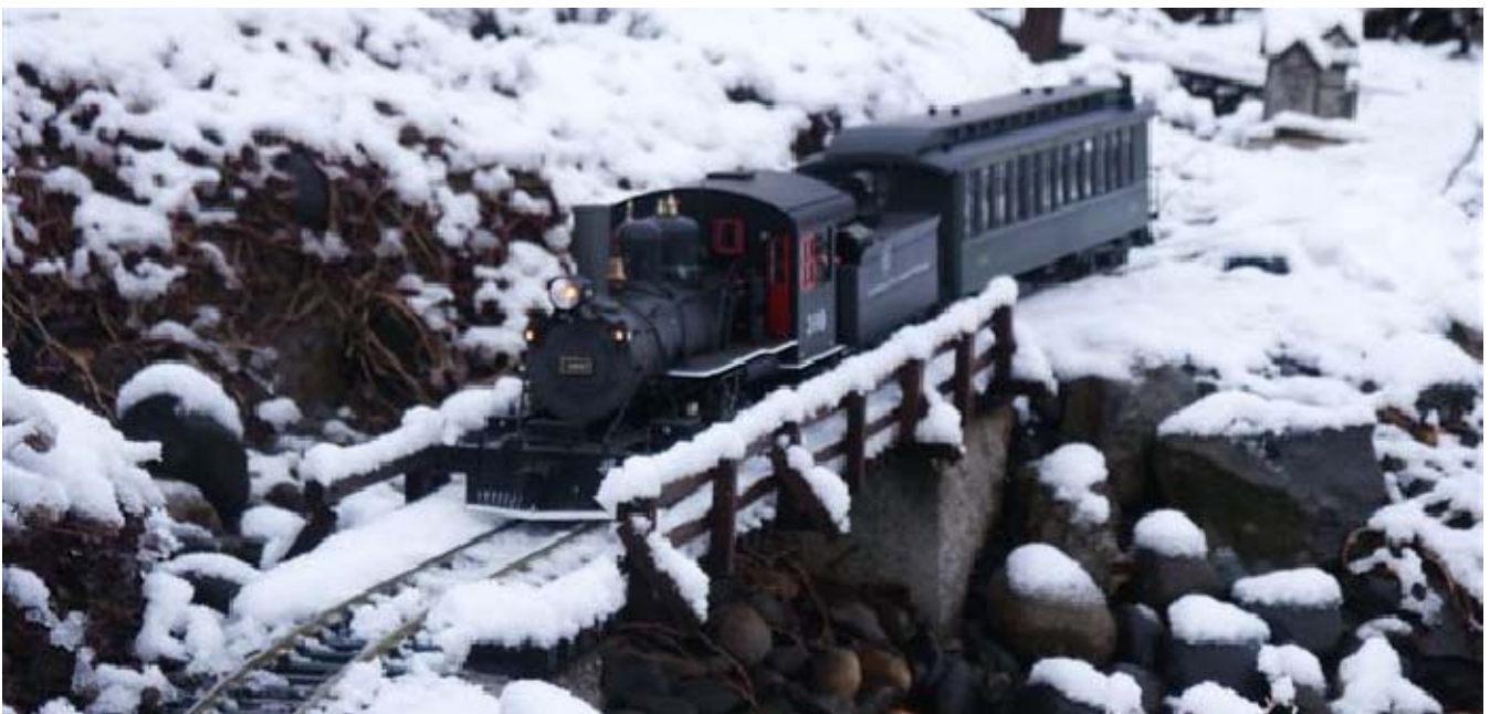
DR & GW 360 2-8-0 with passenger car

Whiskey Creek RR. The Heisler was used to clear the tracks of snow. Both trains ran on battery & RC around the complete lay out.