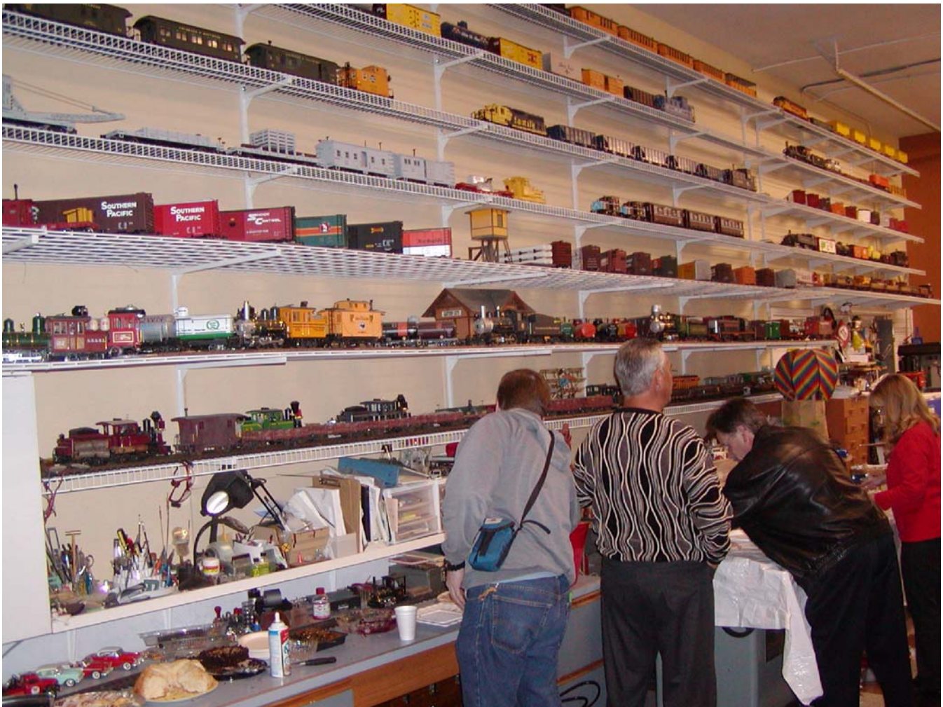
Walls of trains? All of the walls display Joe's trains.