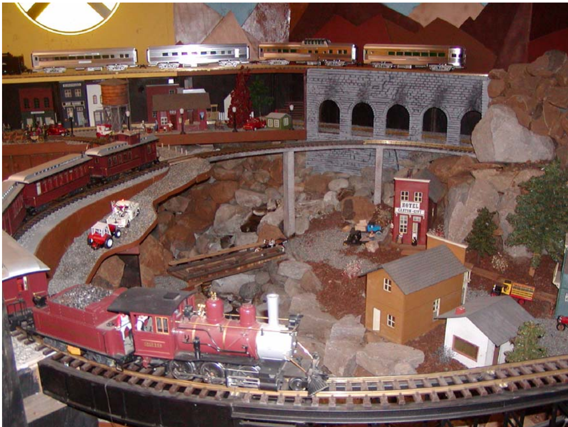
A scene on the Underground Railroad.