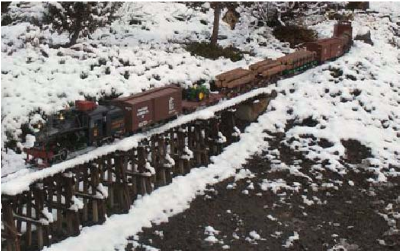
Heisler with logs cars and mixed freight