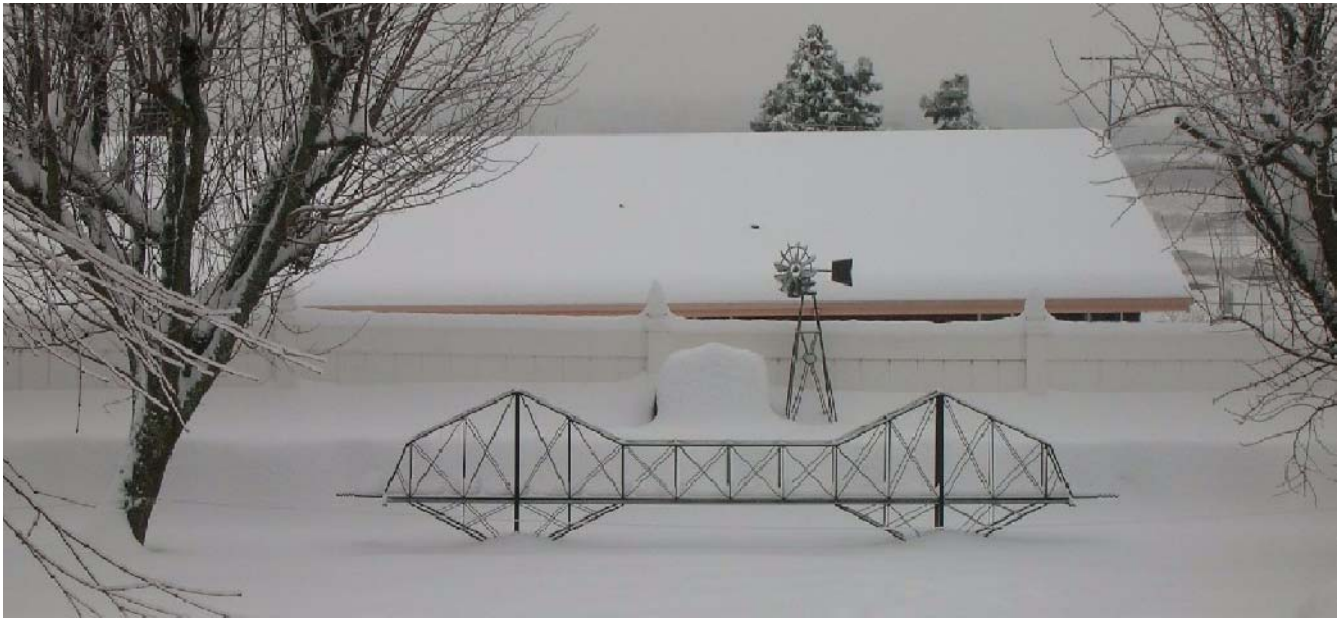
December 22, 2008 — There is a railroad somewhere under the snow. The rain is yet to come.