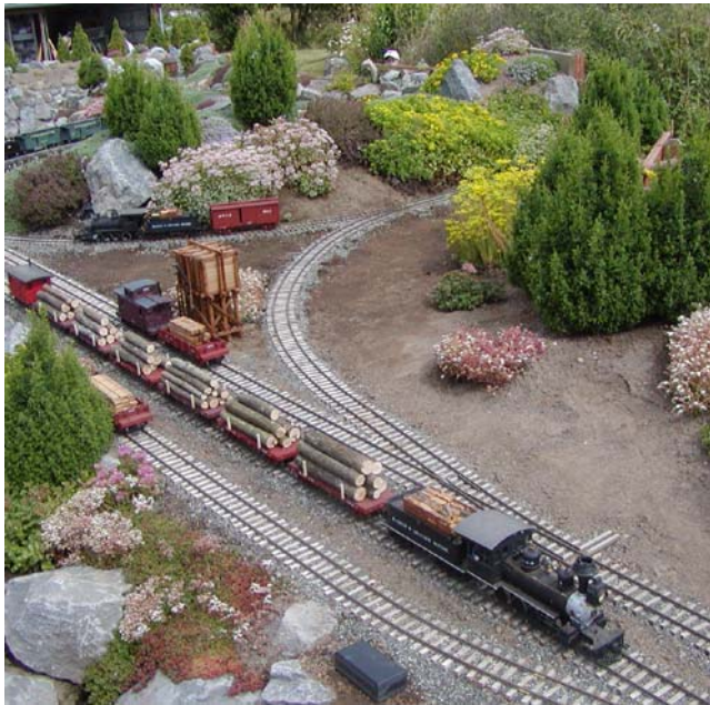
The Odell Summit wye; a busy turn around