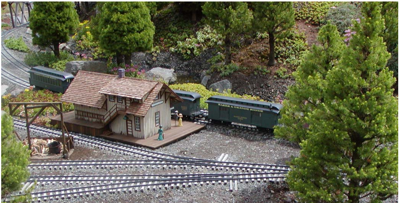
Whiskey Creek Station

trestles. There is a awesome trestle prior to arriving at the Odell Summit wye. All of the track is hand-laid. The stub switches are a design from the early days of railroading where there were no moving points. A large lever shifts the track on the roadbed to align with the desired direction of travel. The railroad is either battery powered or live steam.