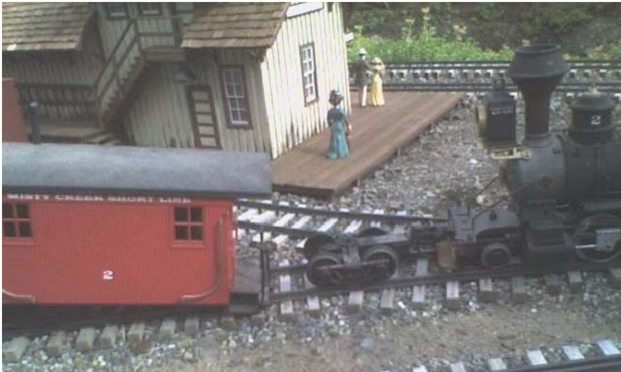
Oops! The No. 2 caboose lost a truck.

Th crew jacked up the caboose and rolled the truck back underneath in only two hours. Bystanders cheered at the completed feat.