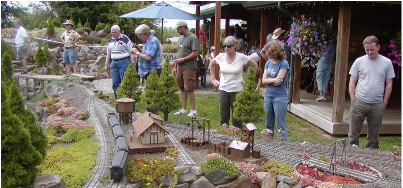
A busy afternoon at the railroad

The Baker and Grand Ronde Railroad is a point-to-point that leaves the train assembly yard in the shop; or more officially, leaves the Whiskey Creek Station in the valley and winds and climbs through the mountain range to the Odell Summit wye. The rail line passes through some spectacular scenery as it traverses over water features on hand-built