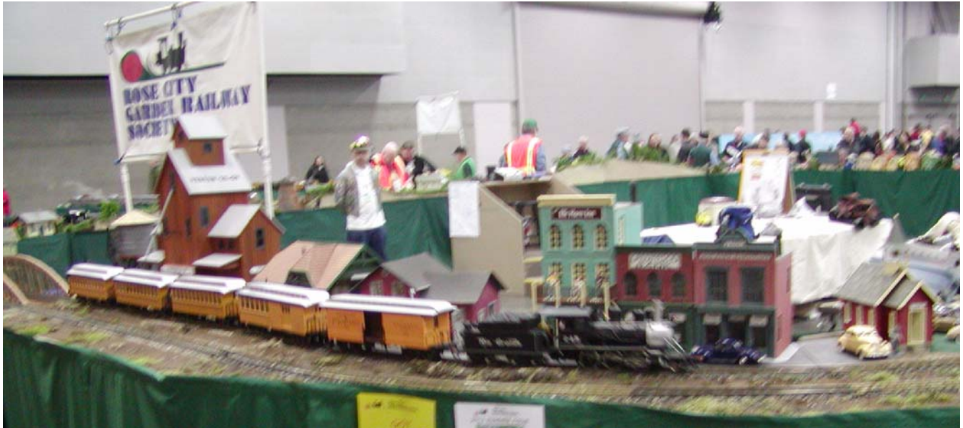
Bill Dippert's Rio Grande passenger train makes an extended run.

How do you heat the boiler? How do you control it? How often do you have to give it fuel and water?