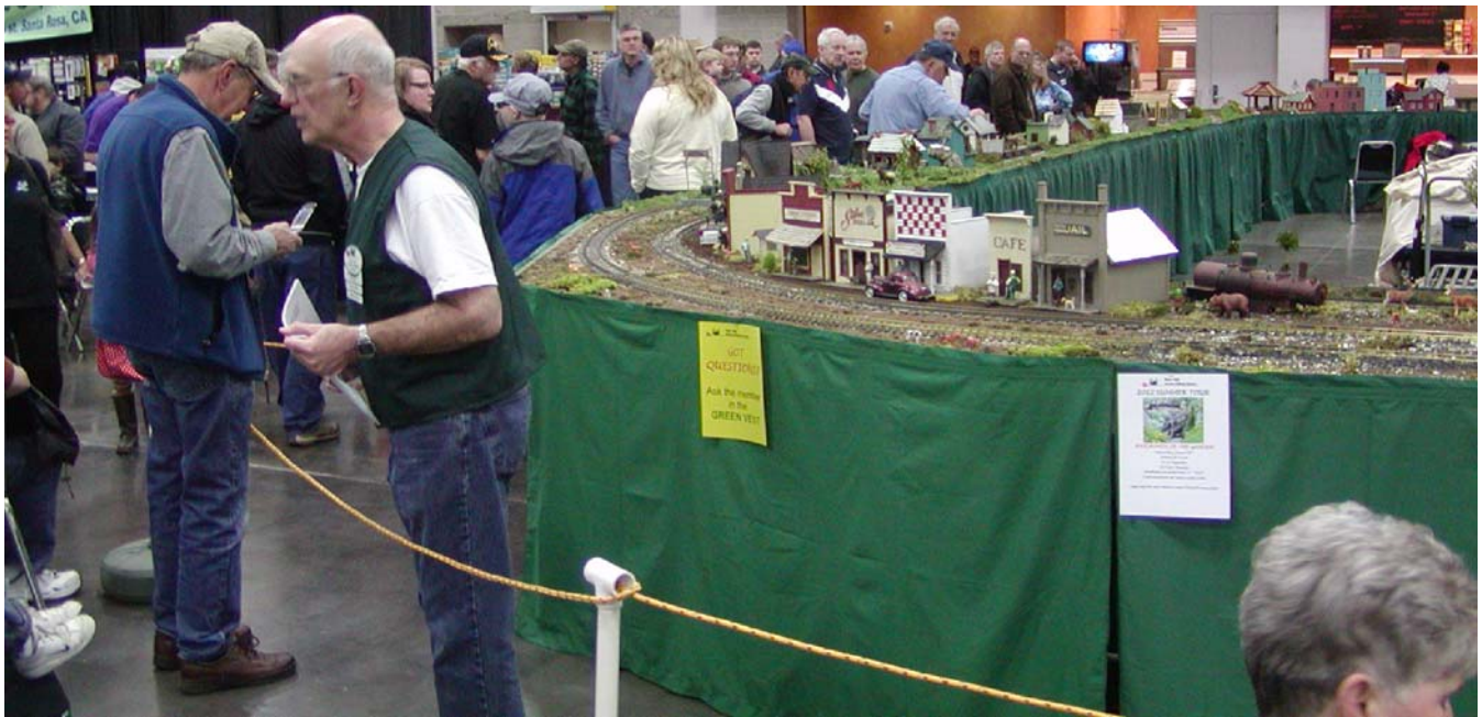
Tom Gaps was kept very busy answering questions and handing out fly-sheets advertising the RCGRS "Railroads In The Garden Summer Tour"

large scale indoor layout. About 30 members worked most of the day on Friday, February 24 th setting up, connecting and leveling the modules. Several of the members adopted one or more of the modules to decorate them with scenery and buildings.