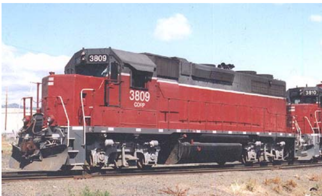
Many of the current locomotives are GP38-3 and painted in CORP colors.

Cresting the top of Merlin Grade near Hugo, this Medford — Glendale Hauler displays quite a diversity of railroad heritage and paint schemes on this April 1995 morning. All units are GP-38s except for the single ex-BN GP-40. Four to six locomotives and 30-car trains or less are typical on this railroad.