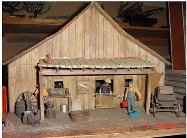
Mucking out the stable on the “The Lake View and Boulder Railroad”