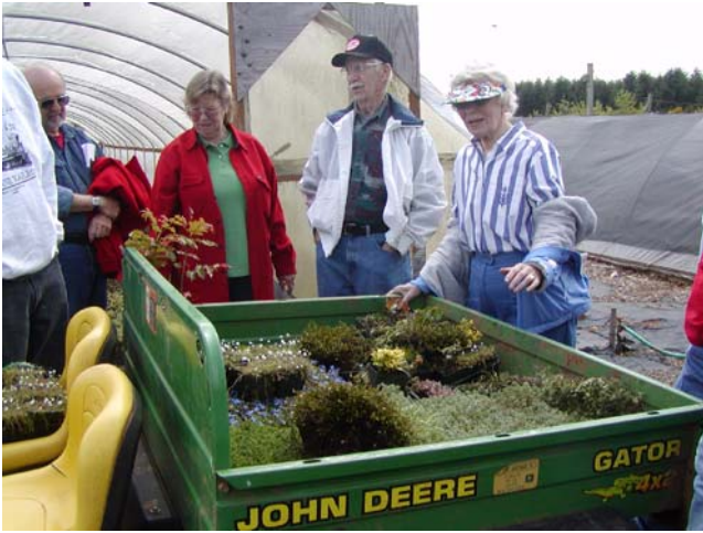
Paying the bill for the selections

Saturday, April 30th, eight members visited to the Beaverlake Nursery. This is a nursery that specializes in ground covers. We learned a lot about ground covers and bought a lot.