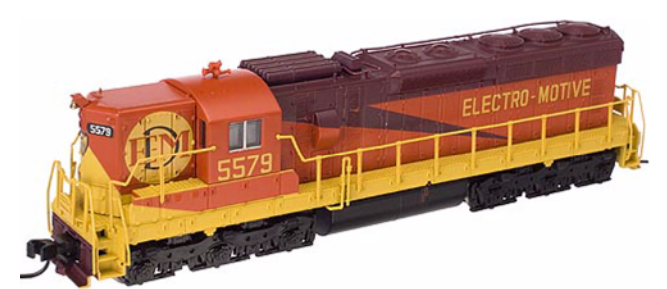
Model of EMD demonstrator 5579

C&S SD9 828 was sent to the FW&D shops where it received new Chinese red paint, a large snow-plow, and flangers on the front truck to scrape ice along the track. It was then sent to Leadville to replace C&S Engine 641. So successful was the SD9 828 in this service, that it operated for 24 years until the mine shut down at Climax.