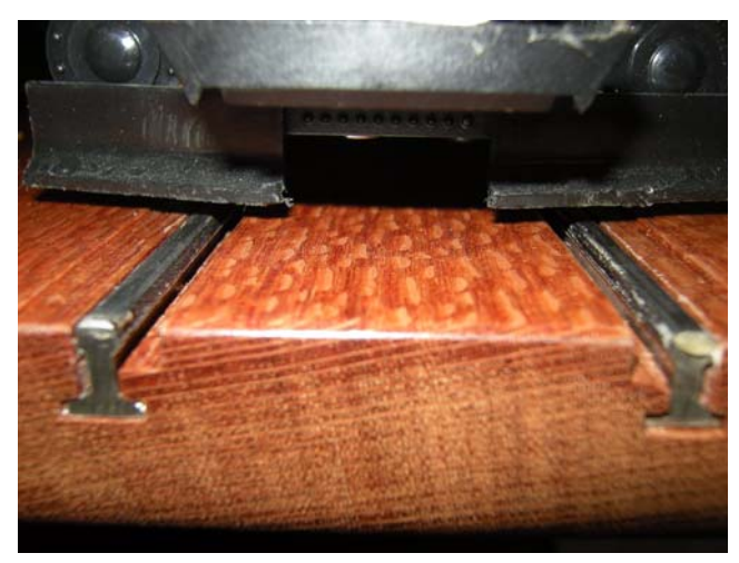
Inlaid track in African leopard wood

Split–Jaw Products is a small locally owned manufacturer that produces and markets world-wide Large Scale Rail products and does custom work using a CNC milling machine. They routed in the stainless steel rail into the leopard wood after testing a small piece beforehand to prevent damage to tools used normally with hard plastic.