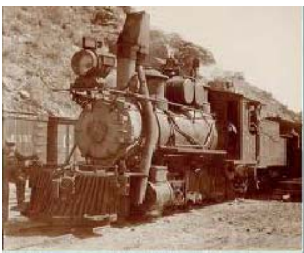
C&S #59