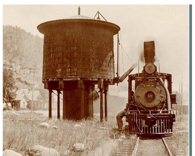
C&S narrow gauge #10 gets water at Idaho Springs.