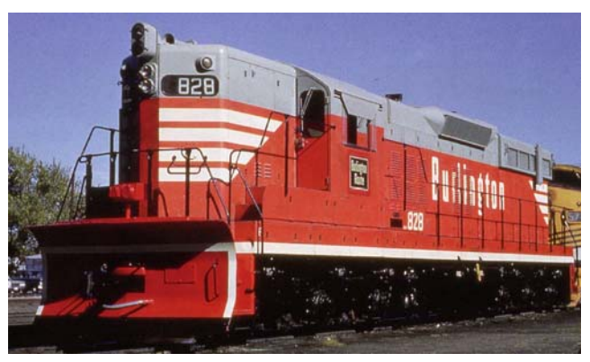
C&S SD9 828

C&S SD9 828 was sent to the FW&D shops where it received new Chinese red paint, a large snow-plow, and flangers on the front truck to scrape ice along the track. It was then sent to Leadville to replace C&S Engine 641. So successful was the SD9 828 in this service, that it operated for 24 years until the mine shut down at Climax.