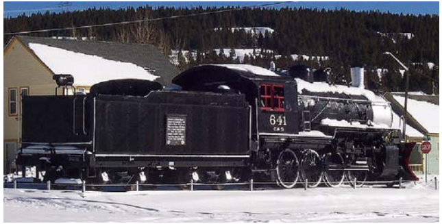
C&S Engine 641, the line's last operating standard–gauge steam locomotive, used on the Climax–Leadville run until 1962. On display in Leadville; photo 2010.

For several years after the remainder of the C&S ran only diesels with the arrival of EMD SD9s 831–842 in 1959, the railroad resisted any attempts to run diesels on the isolated Leadville-Climax branch high in the mountains of Colorado. The elevation ranged from 10,000 feet at Leadville to over 11,300 feet at the Climax molybdenum mine/ mill 14 miles distant. The conventional wisdom of the steam era veterans said that the diesels would starve for air and operate inefficiently, if at all, in the rarified atmosphere. EMD convinced the C&S in the summer of 1962 to run the still unsold SD24 demonstrator #5579 on a siding at the Leadville engine terminal - not moving nor pulling a load - to prove the diesel engine would run. When it was found that the engine ran in a perfectly normal fashion, even without the turbocharger engaged, the last days of steam power on the C&S had arrived.