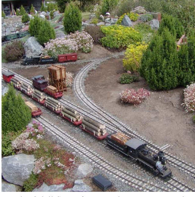
The Odell Summit wye; a busy turn around