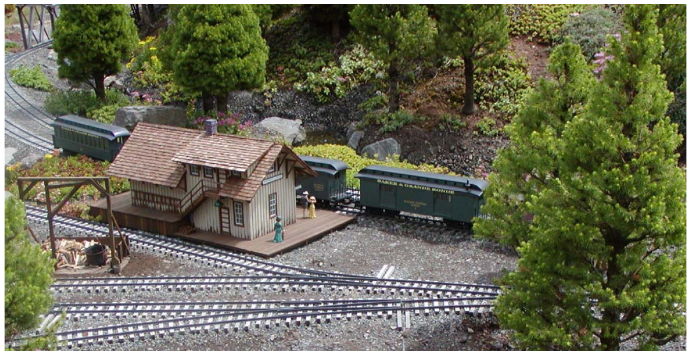
Whiskey Creek Station

trestles. There is a awesome trestle prior to arriving at the Odell Summit wye. All of the track is handlaid. The stub switches are a design from the early days of railroading where there were no moving points. A large lever shifts the track on the roadbed to align with the desired direction of travel. The railroad is either battery powered or live steam.