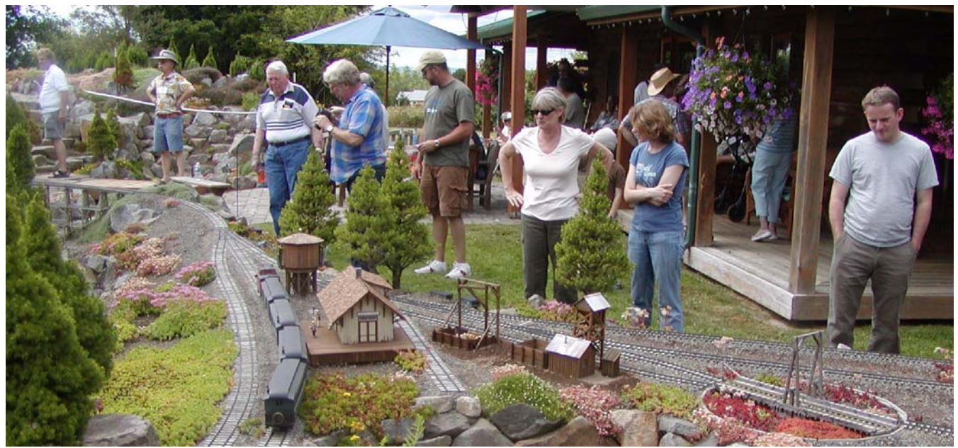
A busy afternoon at the railroad

The Baker and Grand Ronde Railroad is a pointto-point that leaves the train assembly yard in the shop; or more officially, leaves the Whiskey Creek Station in the valley and winds and climbs through the mountain range to the Odell Summit wye. The rail line passes through some spectacular scenery as it traverses over water features on hand-built