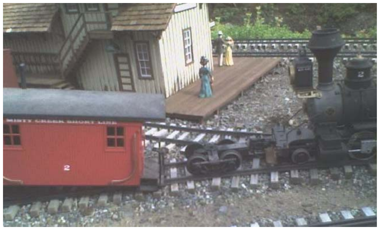
Oops! The No. 2 caboose lost a truck.

Th crew jacked up the caboose and rolled the truck back underneath in only two hours. Bystanders cheered at the completed feat.