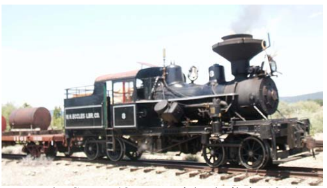
The SVRy 40-ton Heisler built in 1915

For over thirty years the Sumpter Valley Railroad Restoration Inc. has been dedicated to rebuilding this remnant of the past for the enjoyment of future generations. Since the first excursion train pulled out of McEwen station in 1976, an almost all volunteer staff has rebuilt over five miles of rail line, fully restored two original steam locomotives, refurbished numerous pieces of rolling stock, and constructed all the facilities it takes to run a railroad.