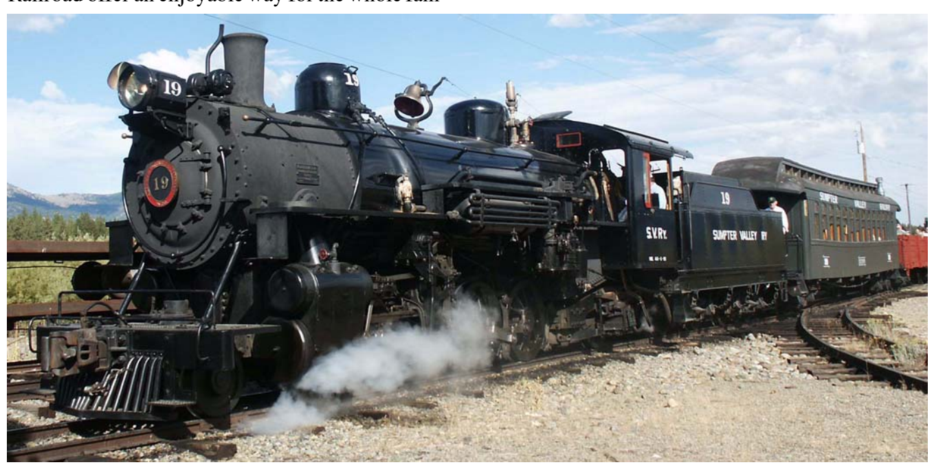
The SVRy 2-8-2 "Mikado" built in 1920 by ALCO

Visitors will have an opportunity to tour the gold dredge at Sumpter and the back shop of the SVRy. Sumpter is a nice little town to explore before the return trip.