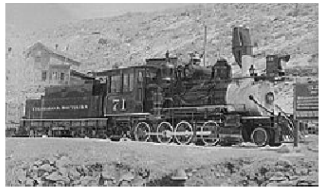
C&S Consolodation No. 71 circa 1941