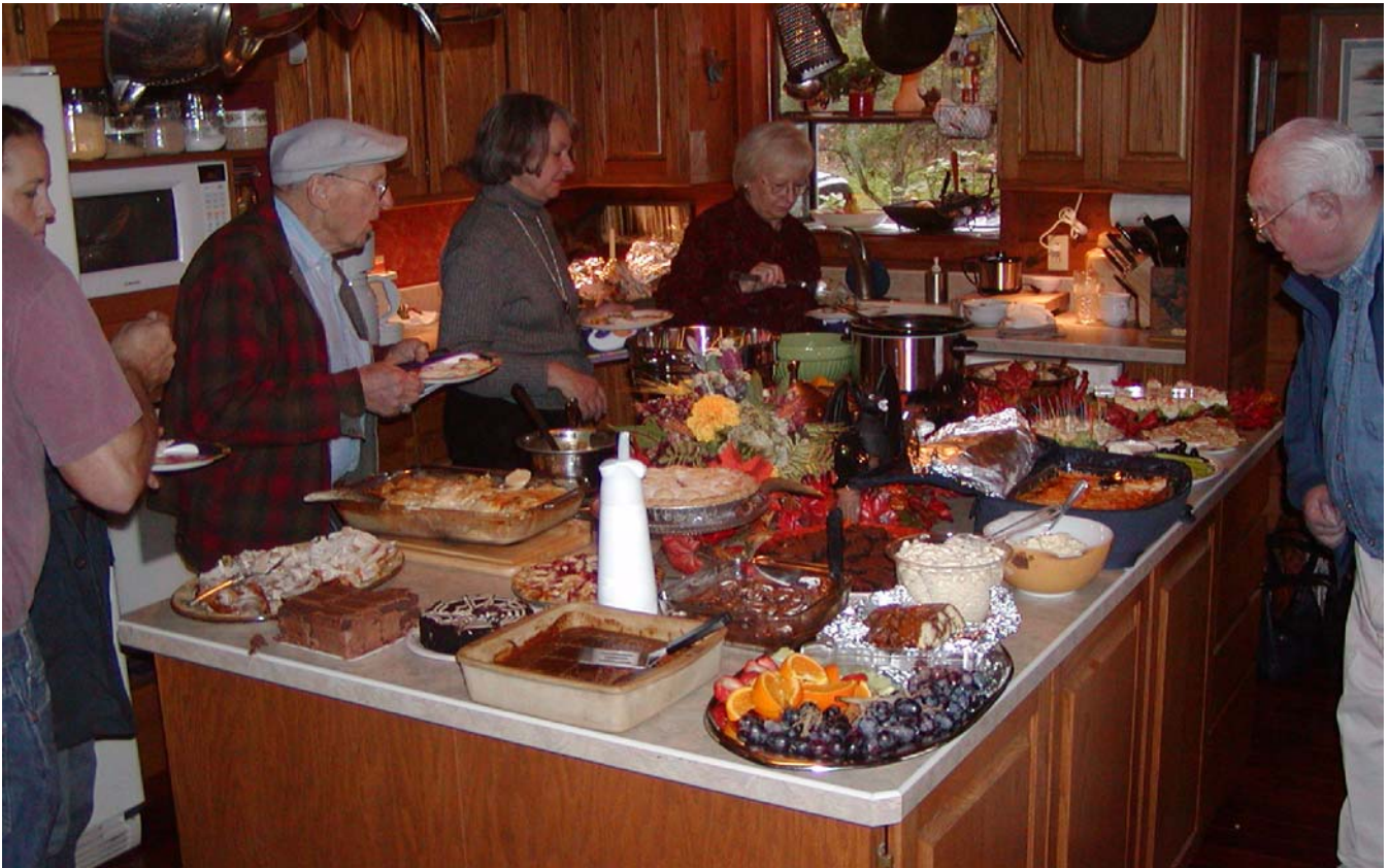
The food was plentiful and wonderful at the Ghost Train event