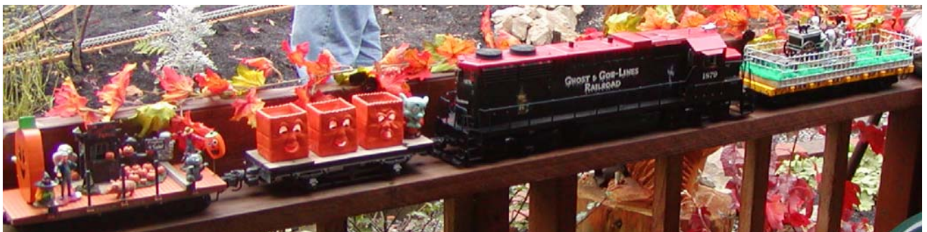
Some Ghost Train cars