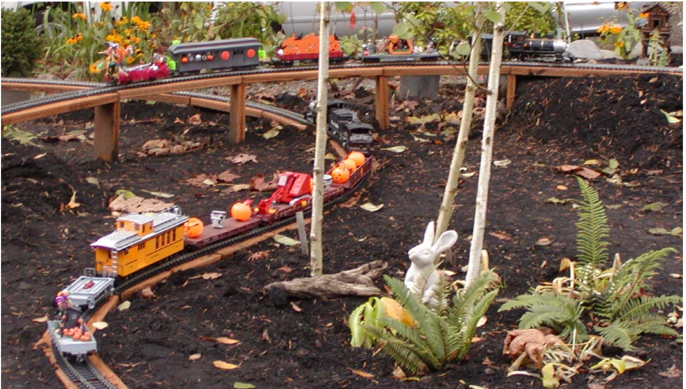
Two of the Ghost Trains on the western loop