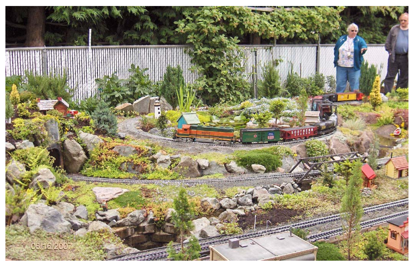
A GP39 pulls a mixed freight through the curves of the Trout Lake & Cumberland Railroad

Ron's beautiful, new 2–8–2 didn't care for two of the TL&C curves, so he operated it on limited stretches, running it forward and backward equally, and it had a good break in.