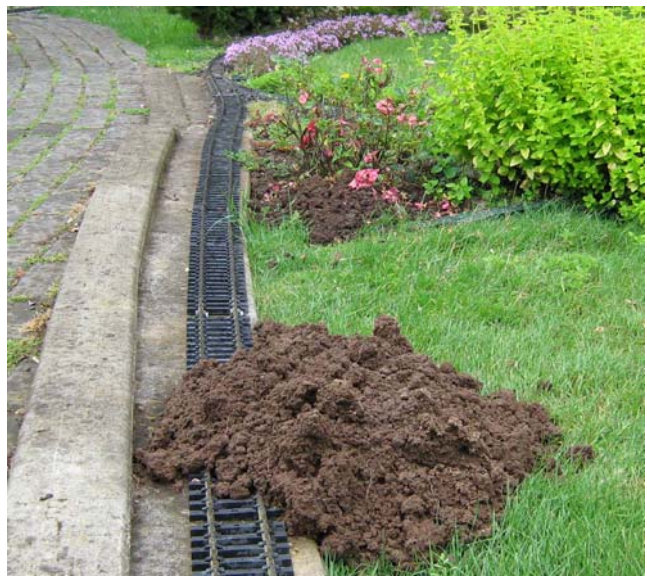
Noted in Passing: The week after the Summer Tour, the gophers attacked and left four piles of soil; two on the track. Fortunately, the "adage" for things going wrong at the wrong time didn't apply to this scene.