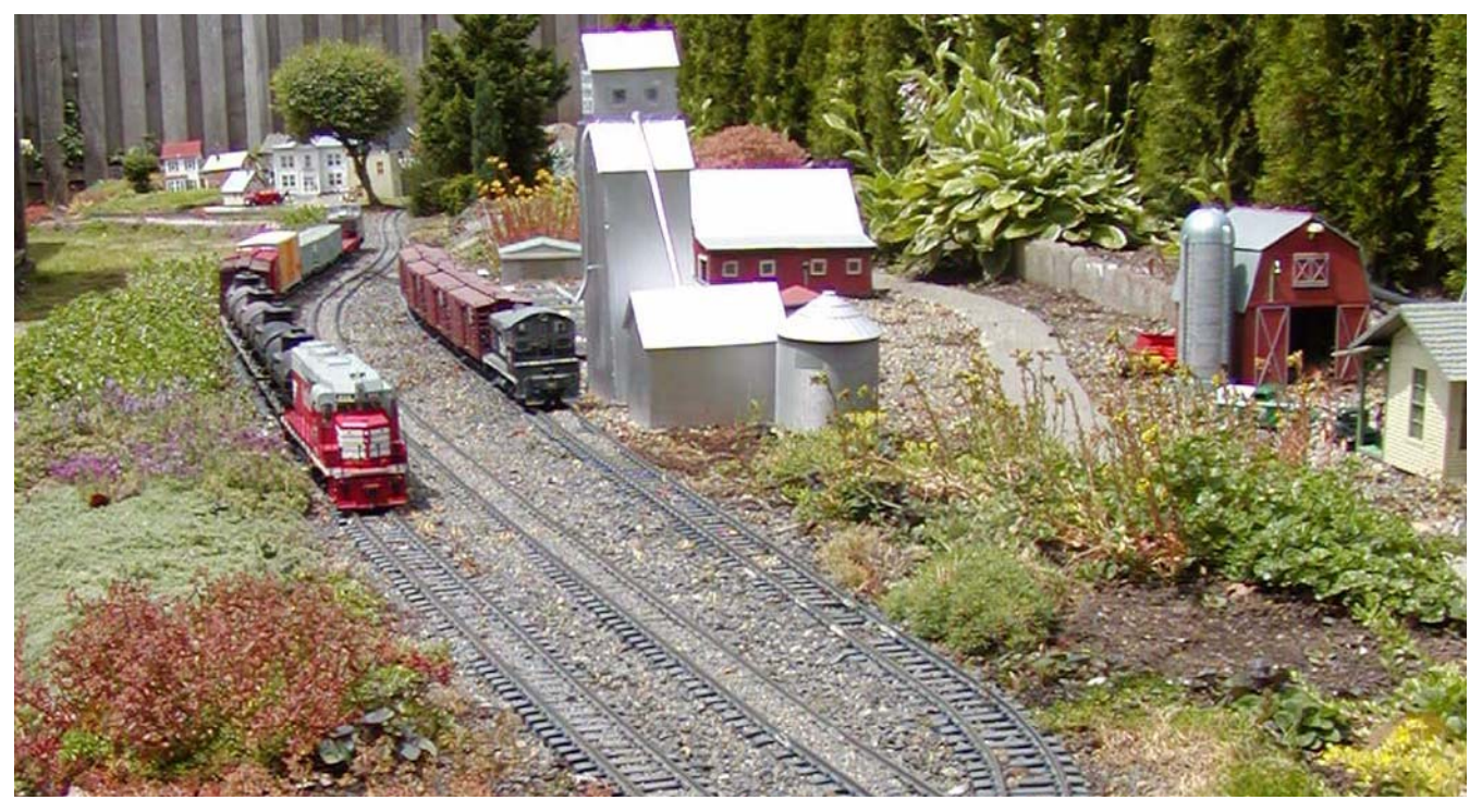
A mixed freight train leaves Emersonville and rolls through the farm land. A switcher spots stock cars for loading from the stock pens. This year's weather has caused all of the ground covers to be particularly lush to the point of overgrowing some areas.