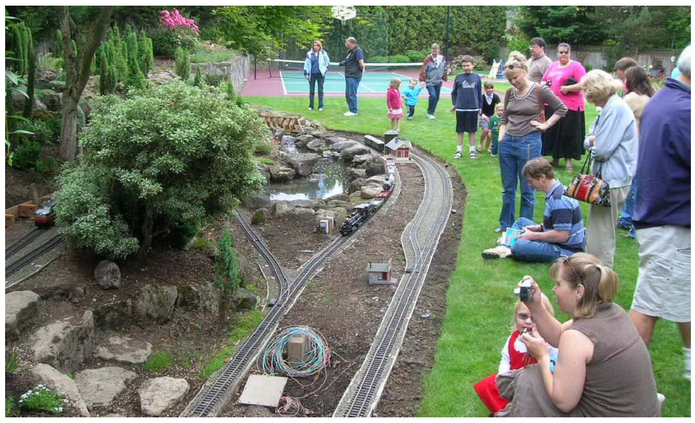
Some of the spectators visiting the operation of the Colorado Southern Railroad

The Colorado Southern Railroad was in operation for the Summer Tour. As with all of the garden railroads open that day, there was a steady flow all day of guests to see the railroads.