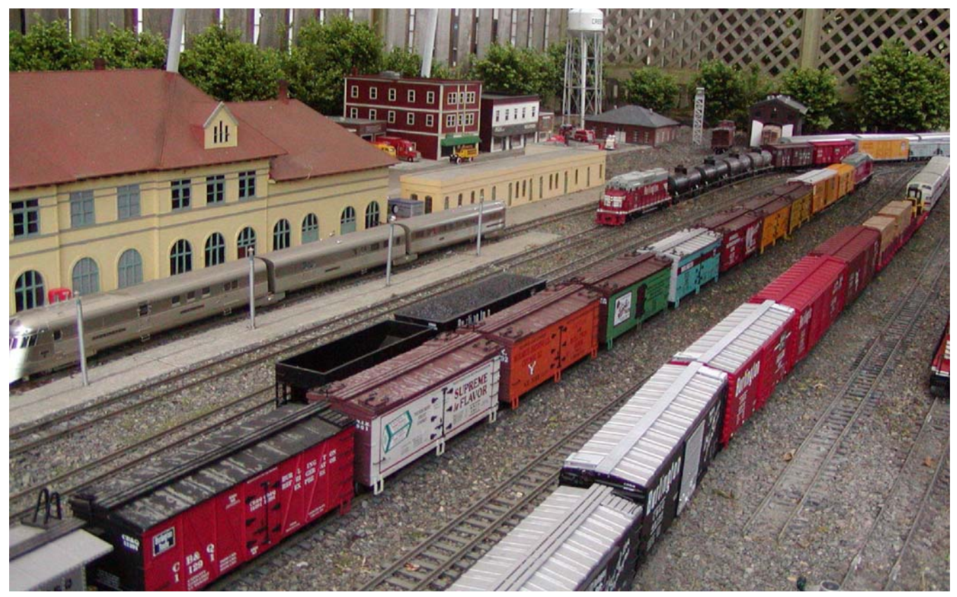
In the Creston switch yard: The Pioneer Zephyr waits at the station as a freight train enters the yard. A refrigerator car train and a mixed freight wait their turn to depart.