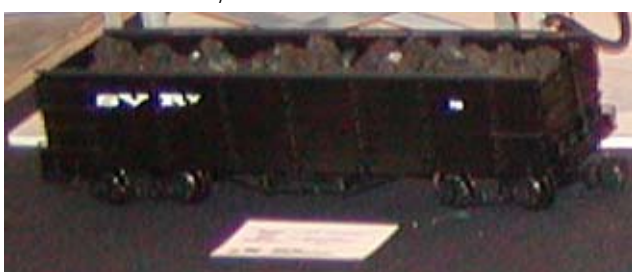
1st - Doug Vorwaller -SVR Gondola w / Coal Load