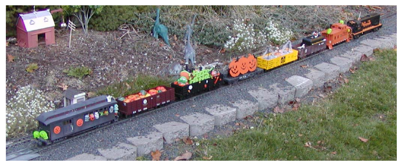
A U25B pulls another ghost train through the upper right-of-way