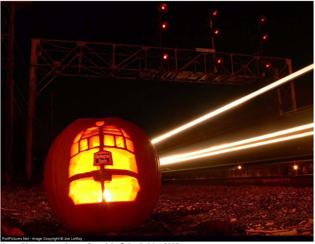
Remarks: On May 26th, 1934, the Pioneer Zephyr made its record-breaking non-stop dawn-to-dusk run from Denver to Chicago, passing under this signal bridge at Downers Grove, IL. This night, an eastbound coal train led by a pair of SD70MACs does the same. Happy Halloween!